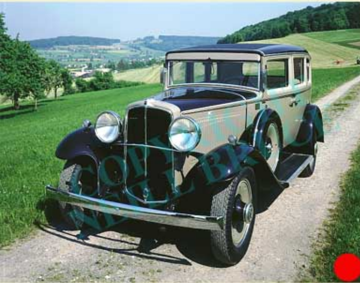
1931 Nash 660 4 door saloon

Detail views are available, except where indicated by a red dot. ●