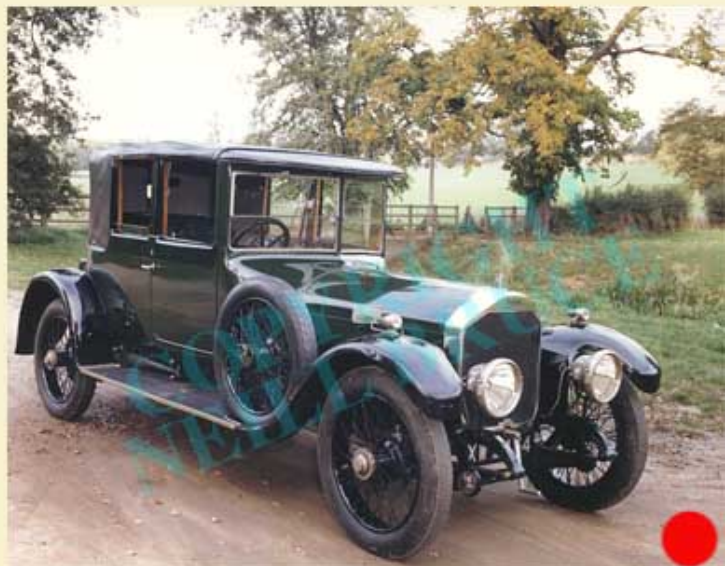
1920 Napier 40/50 3/4 Cabriolet