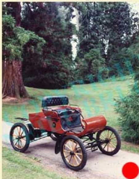
1903 Oldsmobile 3hp Curved Dash

Detail views are available, except where indicated by a red dot. ●