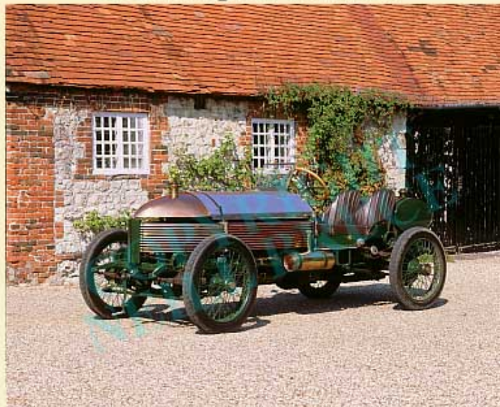
1904 Napier 'Samson'