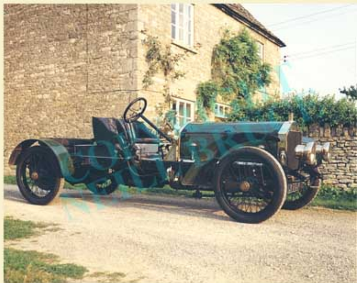
1908 Napier R type Sports