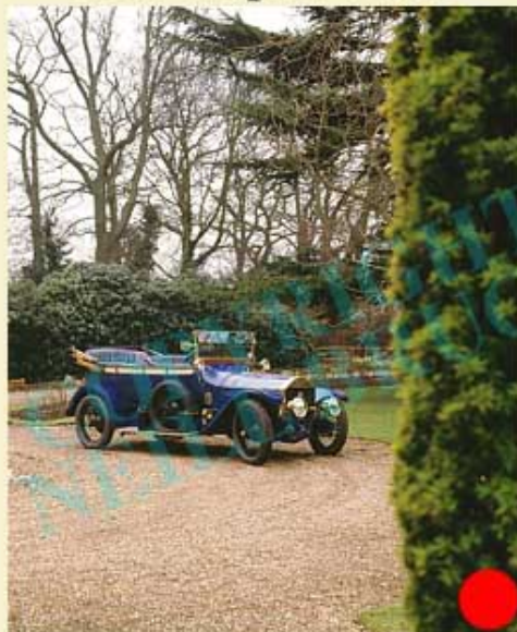
1913 Napier 30/35

Detail views are available, except where indicated by a red dot. ●