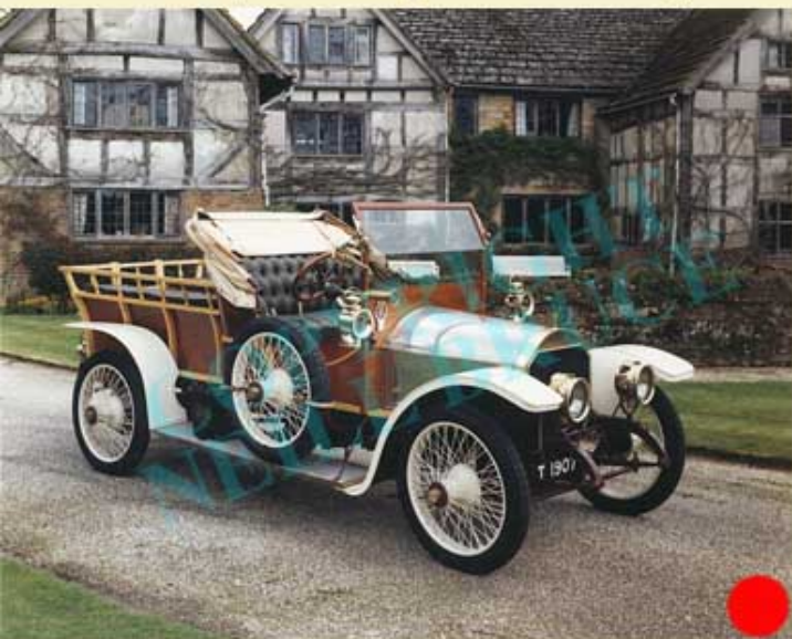
1913 Napier 16hp Estate Wagon