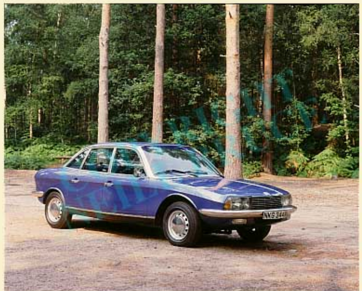
1973 NSU RO80