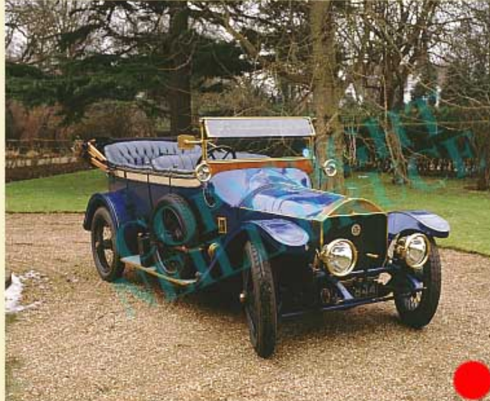
1913 Napier 30/35