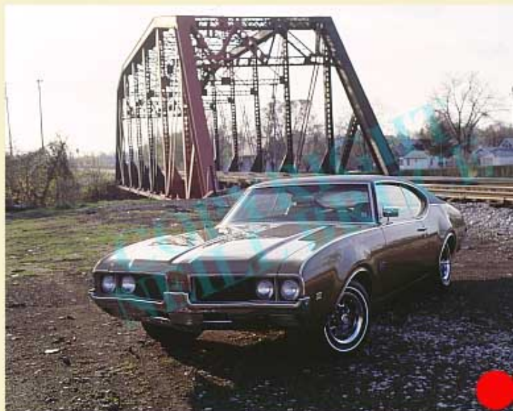
1969 Oldsmobile 442