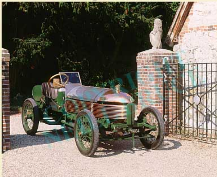
1904 Napier 'Samson'

Detail views are available, except where indicated by a red dot. ●