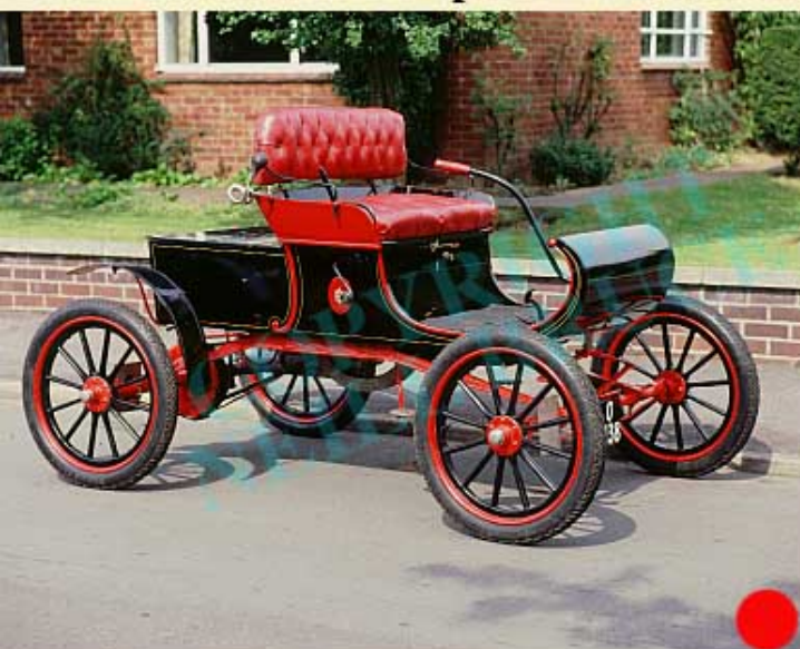
1903 Oldsmobile 3hp Curved Dash