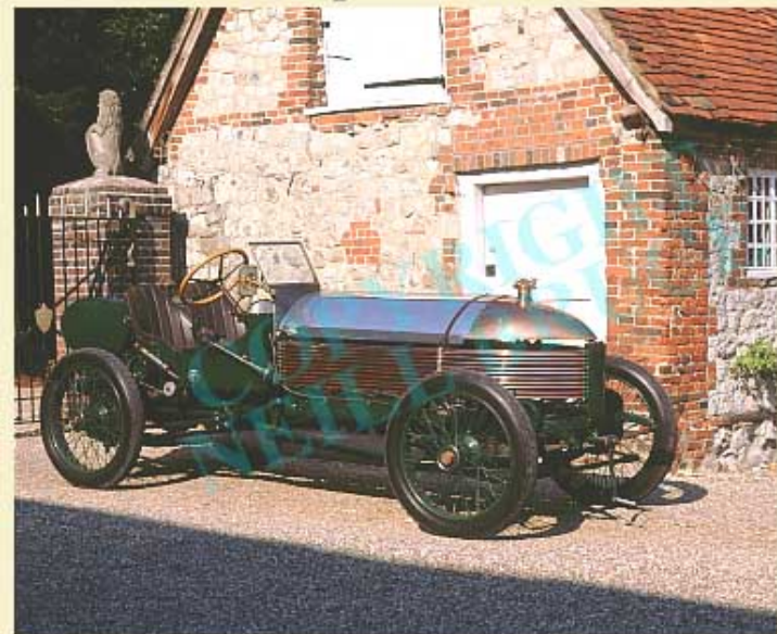
1904 Napier 'Samson'