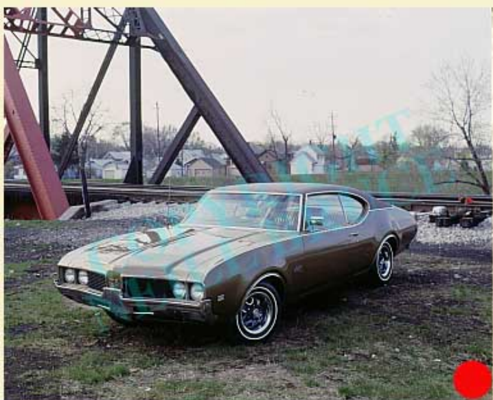
1969 Oldsmobile 442