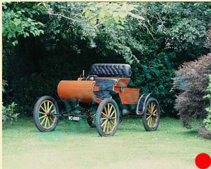
1903 Oldsmobile 3hp Curved Dash