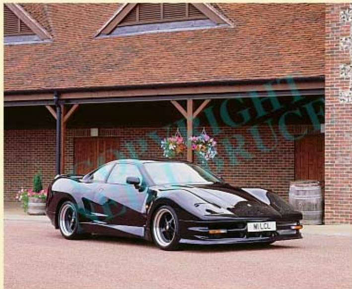
1995 Lister Storm