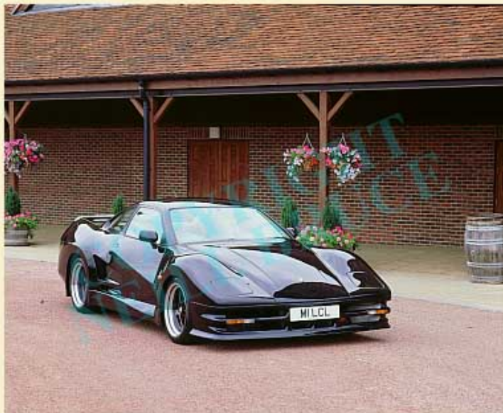
1995 Lister Storm