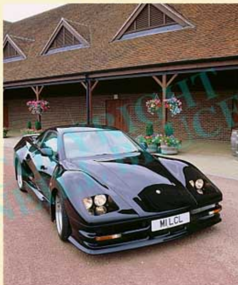
1995 Lister Storm