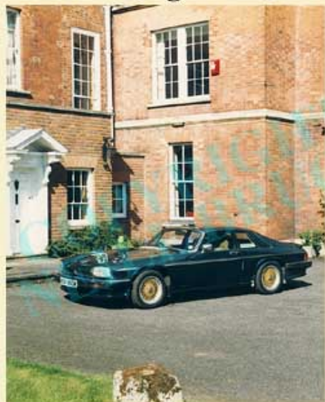
1981 Lister Jaguar XJ-S HE