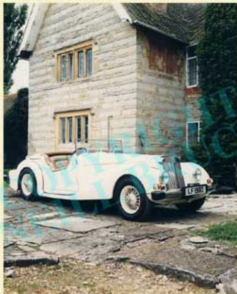
1980 Lea Francis 3.5

Detail views are available, except where indicated by a red dot. ●