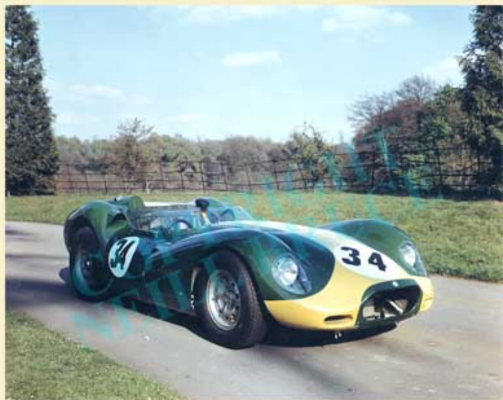
1959 Lister-Jaguar Sports